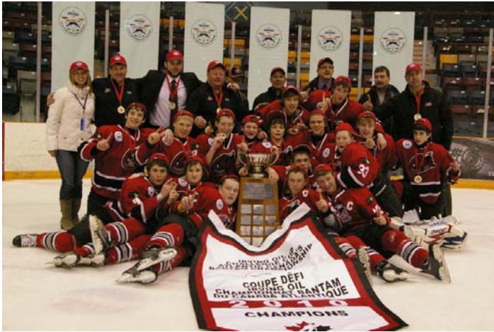
District 3 Irving Oil Caps Irving Oil Challenge Cup Champions