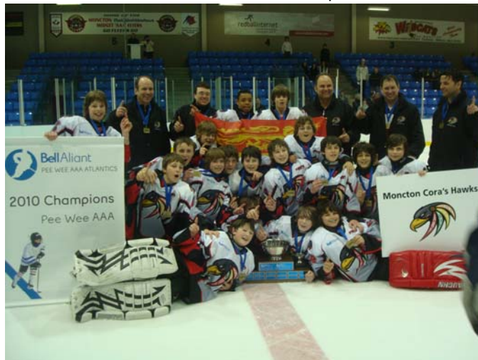
Moncton Cora's Hawks Bell Aliant Atlantic Pee Wee Champions