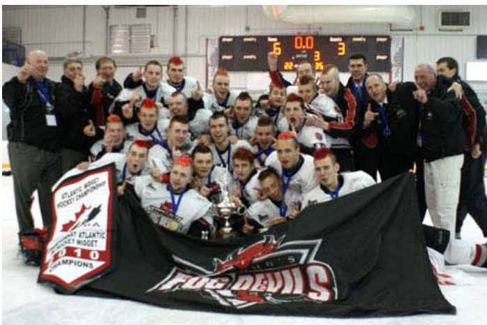
St. John's Fog Devils Atlantic Major Midget Champions